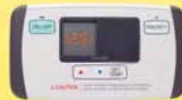
Optional Controller for Bathroom YST-2250

Monitor offers various optional accessories; second remote controller for bathroom, recess box for external unit (MWH180EX), high quality stainless vent, rain cap and termination etc. for flexible installation. The MWH180's compact and light weight design allows for installation virtually anywhere, indoors and outdoors.