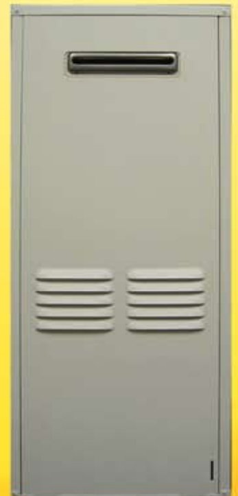
Recess Box RB-100